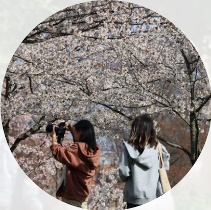
Cherry Blossom Monitoring