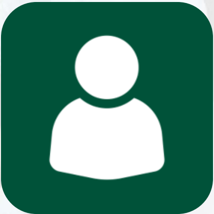
Vacant Program Coordinator Patriot Green Fund