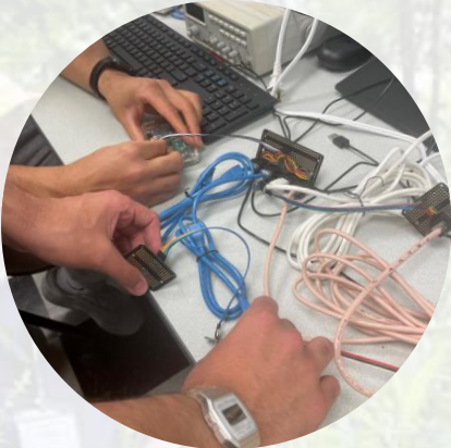
Data Center Management System